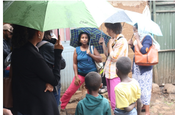
Project partners at Coca Cola Site

The tour commenced with a short visit to EiABC campus followed by a walk through the Informal kebele housing neighborhood at Coca Cola.