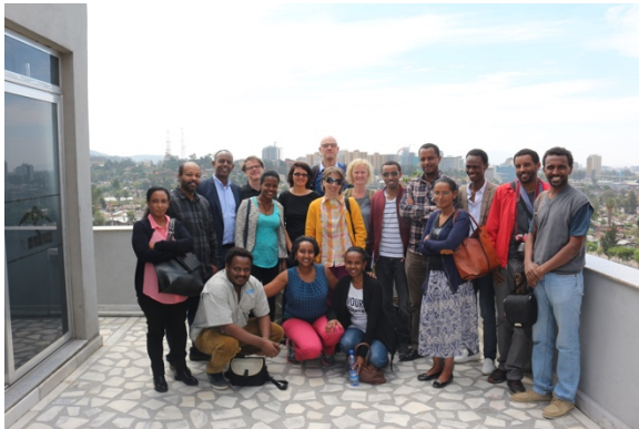
Commencement of thematic training at Tirar Hotel

Thematic Training and Site visit was conducted to SES project partners from DUK, Kassel, Twente (ITC), Mekele and Gondar Universities at Addis Ababa from 01-05 of May, 2017. Partners from Addis Ababa University, Ethiopian Institute of Architecture, Building Construction and City Development (EiABC) hosted the event. The five-day event comprised of site visits and training sessions.