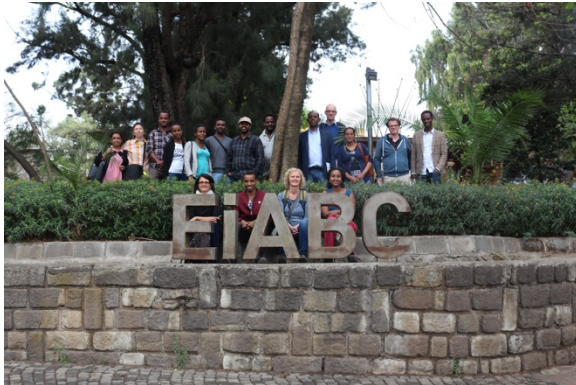
Project partners at EiABC

The tour commenced with a short visit to EiABC campus followed by a walk through the Informal kebele housing neighborhood at Coca Cola.