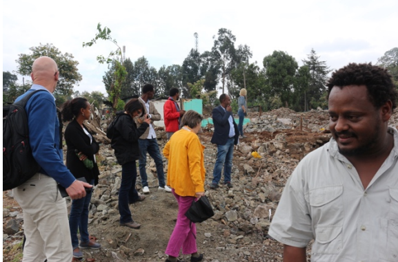
Project partners at Berbere Tera Site

Project partners later visited more inner city informal settlement sites slated for redevelopment at Berbere Tera, America Gibi, Arada, Dejach Wube.