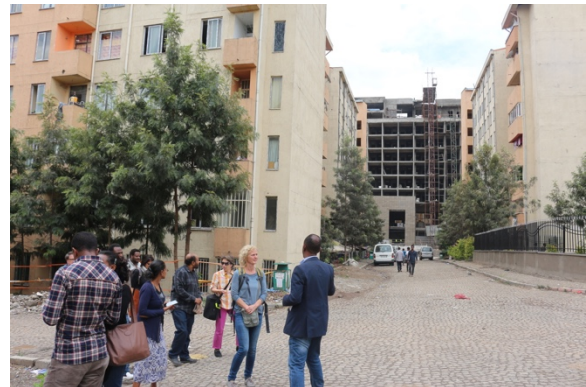
Project partners at Lideta Redevelopment Site

Participants had a chance to observe the level of informality in planning, infrastructure, social and economic aspects, in this neighborhood. Participants also had a short question and answer session with a selected resident of the neighborhood.