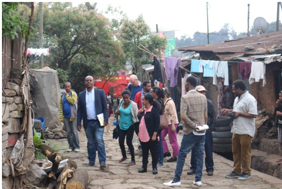
Project partners at Coca Cola Site

Participants had a chance to observe the overall neighborhood planning and the interior of different apartment typologies at the Lideta redevelopment site.